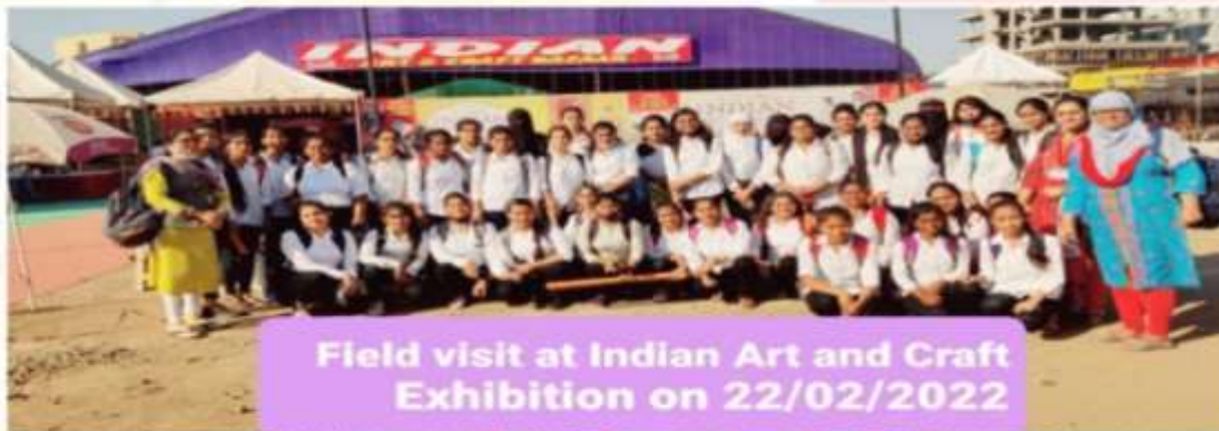
Field visit at Indian Art and Craft Exhibition on 22/02/2022