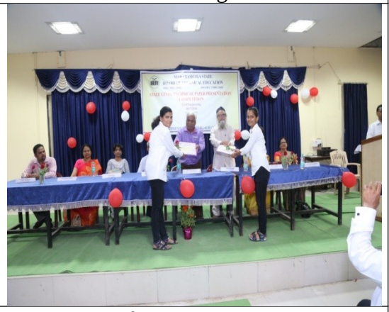
Winners of students participated in MSBTE State level paper presentation competition