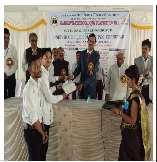
MSBTE Quiz Competition Winner