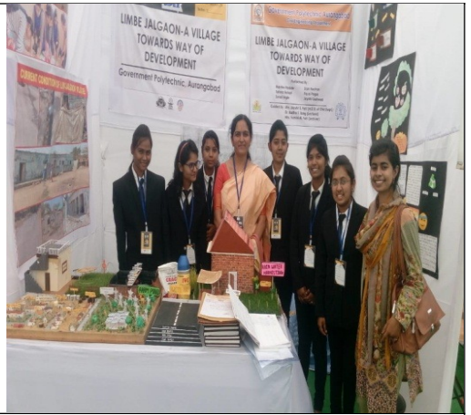
Students participated in Dipex-2019