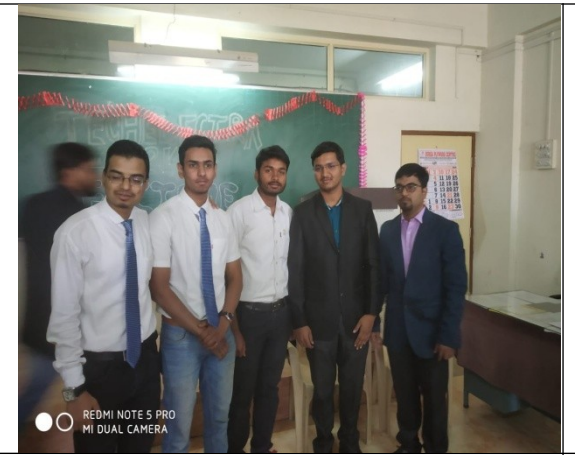
Winner of first prize in state level competition held at MGM and MIT Aurangabad