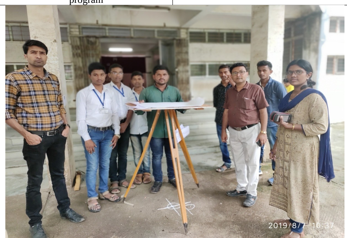
Conducted Practical Exam for the candidate of surveyor post of Forest Department