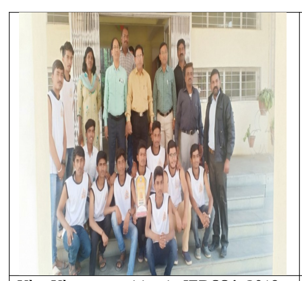
Kho-Kho competition in IEDSSA-2019