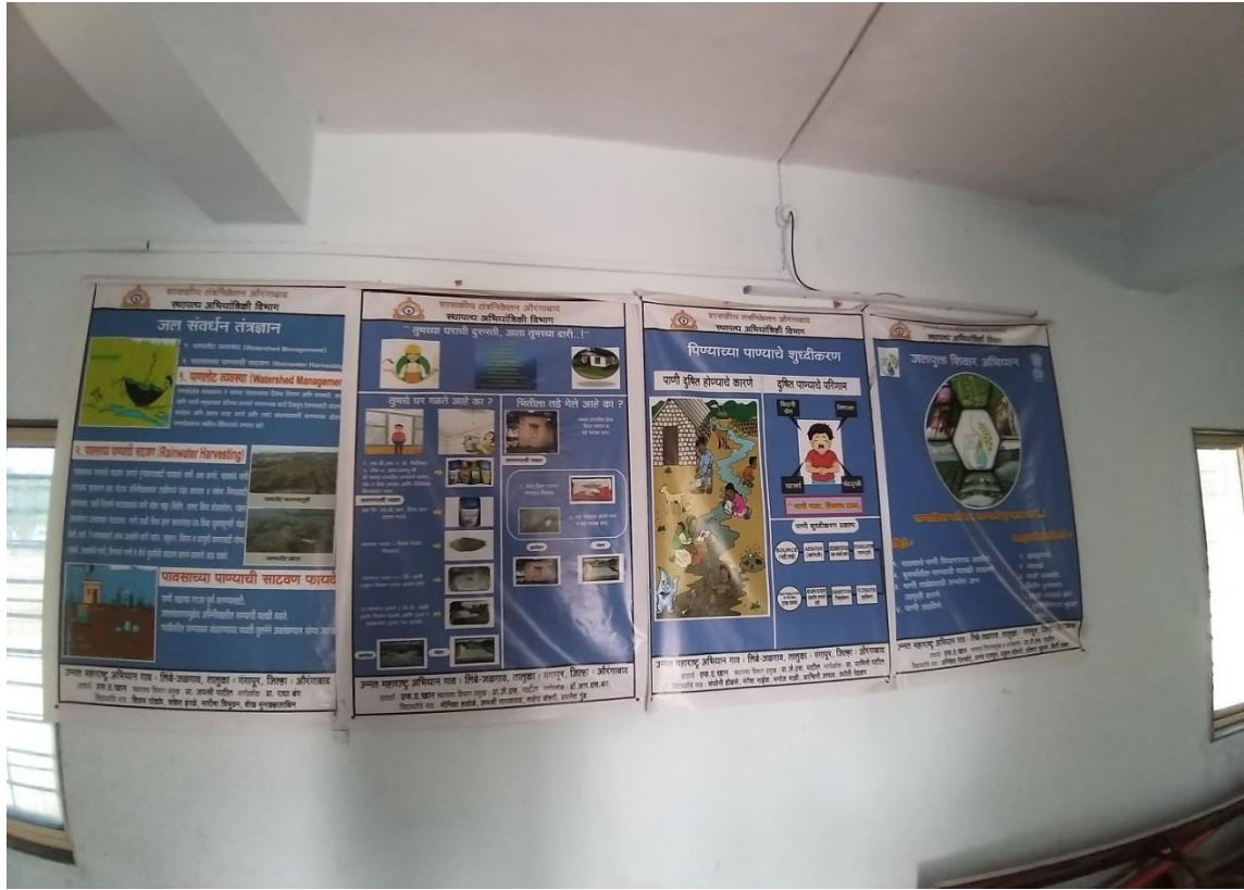
Flex displayed in Grampanchayat at village Limbe-jalgaon