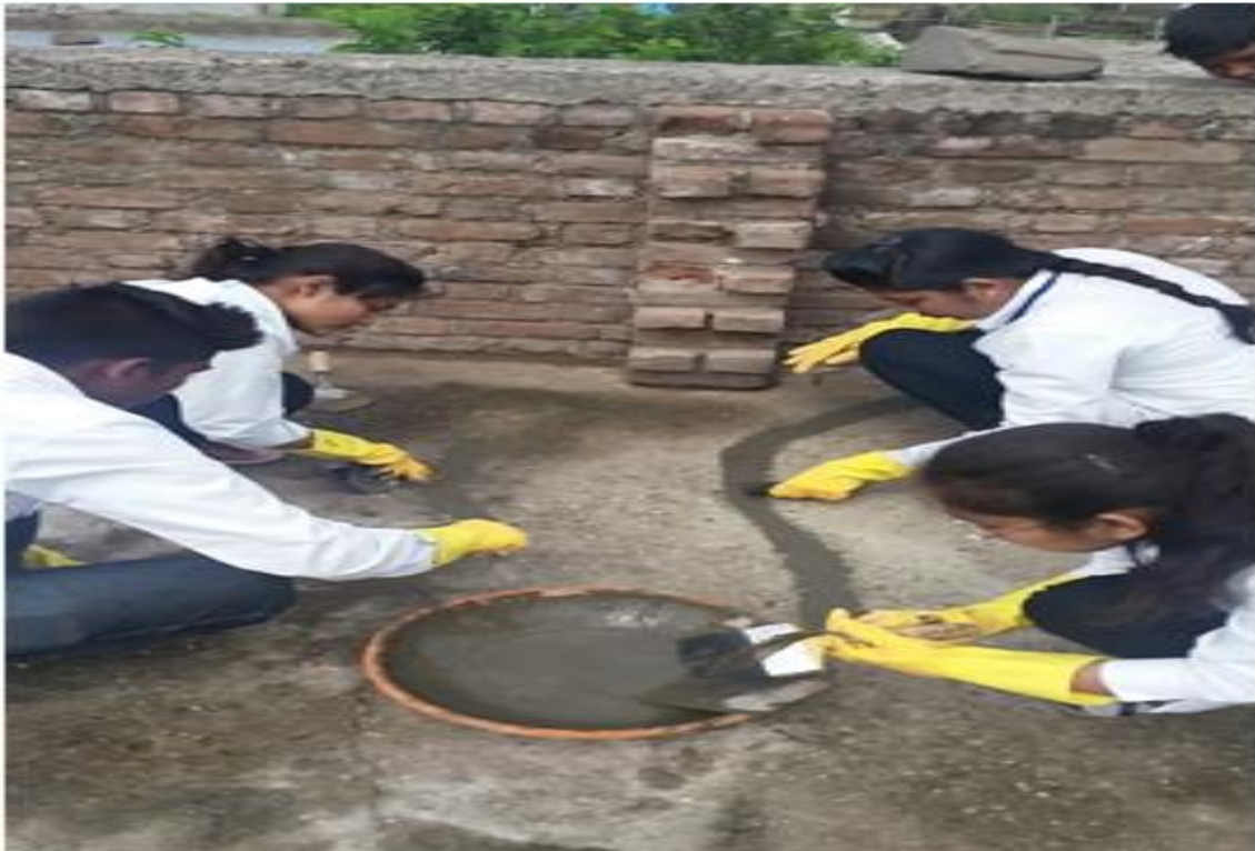
Demo of crack filling of trance by students