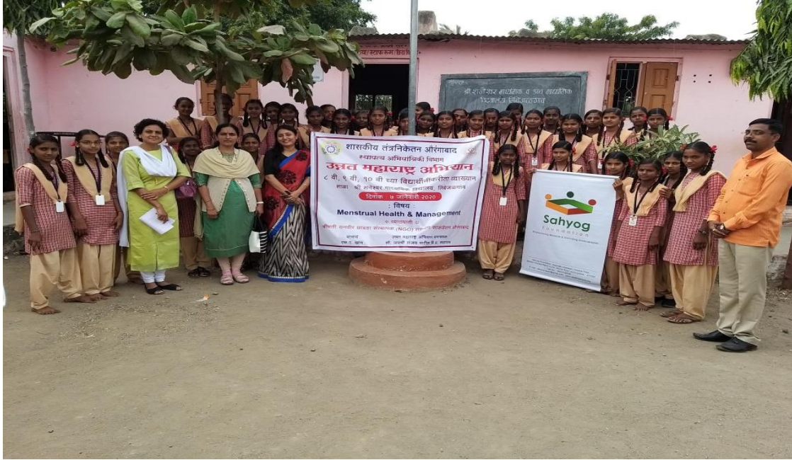
Expert Lecture activity Under UMA in Shri Shanaishwar madhyamik vidyalaya at Limbe jalgaon