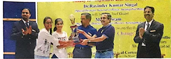
औरंगाबाद : द इन्स्टिट्यूशन ऑफ इंजिनिअर्सतर्फे अभियंता दिनानिमित्ताने घेण्यात आलेल्या स्पर्धेतील विजेत्यांना पारितोषिके देऊन मान्यवरांच्या हस्ते गौरविण्यात आले.

यानिमित्ताने इंजिनिअरिंग फॉर चेंज या विषयावर वक्तृत्व व निबंध स्पर्धा घेण्यात आली. यात औरंगाबाद व जालना विभागातील अभियांत्रिकी पदवी व पदविका महाविद्यालयांतील विद्यार्थ्यांनी उत्स्फूर्त सहभाग नोंदवून आपली मते मांडली. स्पर्धेतील विजेत्यांना