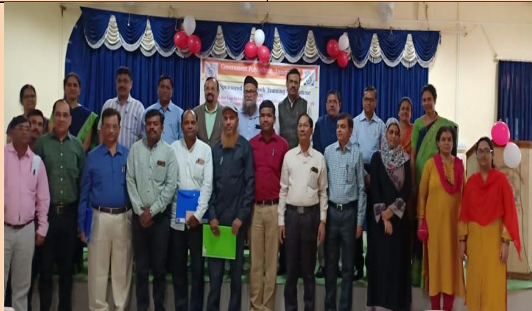
FDP by Electrical Engineering Department (14 – 19 Jan 2019)