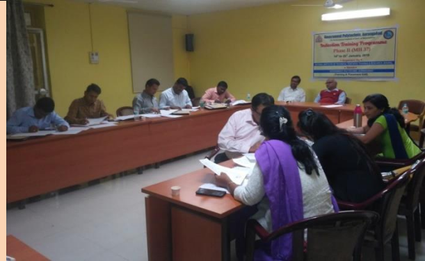
Induction Training Programme Phase II by NITTTR Bhopal (14 – 25 Jan 2019)