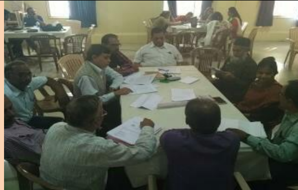
NBA Workshop By NITTTR Bhopal (27 – 28 Dec 2016)